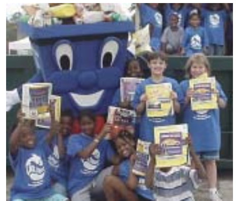
Big Blue and helpers recycled 59 tons of old phone books in 2002.

will bring the wacky professor's reduce-reuse-recycle message to middle-school science classrooms, with music, magic, a game show and prizes. Sponsored by the Office of Waste Alternatives, this edutainment extravaganza will encourage students to make a difference.