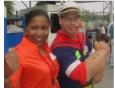
Coordinator with the Popeye character from Universal Studios. members thanked us for being part of their new program and were very enthusiastic about participating in the new work-recycling program.

Everyone attending the event was able to view materials made from recyclable items and the Orange County Solid Waste staff was on hand to answer recycling questions. Many of the Universal Studio's staff