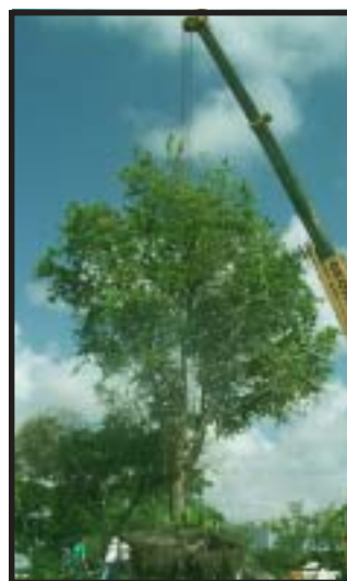
David Bryan Tree Moving relocating 40,000 lb. Black Olive at new Parrot Jungl site.

The site where the new park is now being built is an 86 acre spoil island that was created early in the last century when the ship channels from the adjacent Port of Miami were being dug. When construction began, the site itself was only 6 to 8 feet above sea level and because the island is in a flood zone, the building pads needed to be raised to 12 feet. This was accomplished with over 26,000 tons of structural fill. It was decided to utilize the existing soil for the landscape and augment with compost from the park's composting operation.