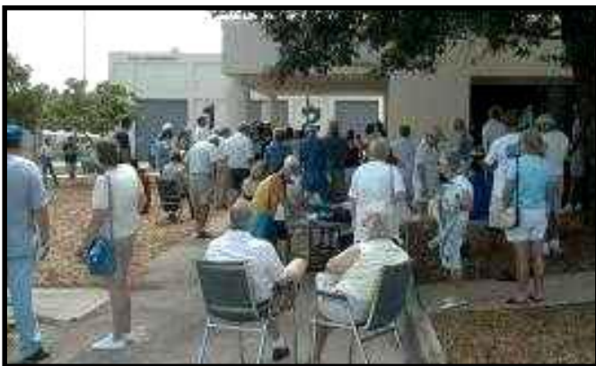
A crowd turned out to make rain barrels in a series of Pasco County workshops in May and June.

The Pasco County Cooperative Extension Service and Utilities Department teamed up to present a series of three Rain Barrel Workshops in May and June at the Public Works Building and in cooperation with Home Depot at the Port Richey store. All workshops were open to the general public. A fee of $17 was