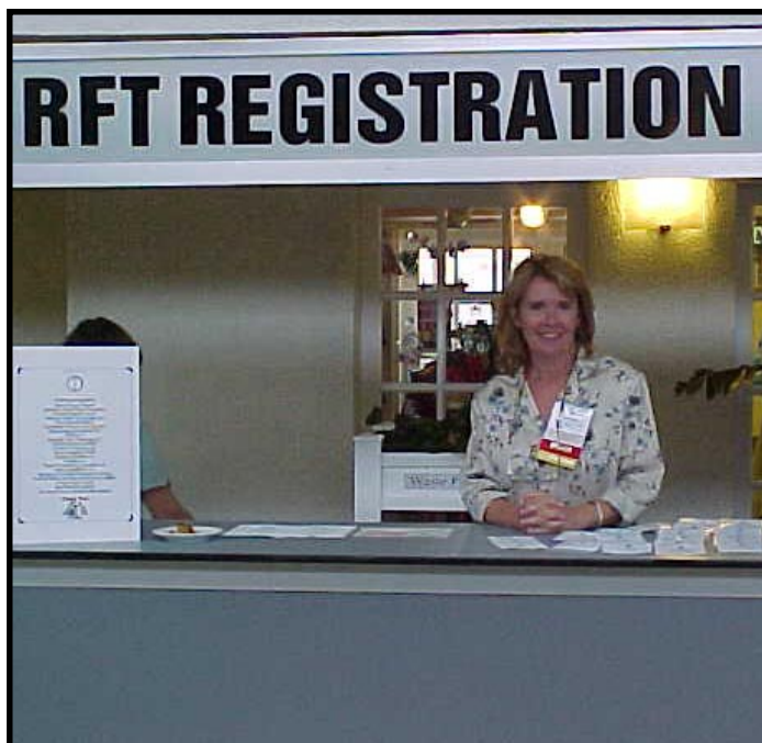
Palmi awaits check-ins