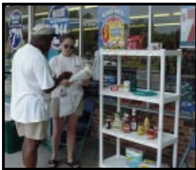
An Alachua County consumer learns how to "Buy S.M.A.R.T."

Alachua County Waste Alternatives staff were pounding the pavement during July and August, visiting 17 area grocery and convenience stores. Their mission was to help citizens save money and reduce trash with a teaching tool consisting of a four-tiered shelf full of typical grocery items. They compare examples of over-packaged, non-recyclable items to items that come in bulk, concentrate or recyclable containers. Each family