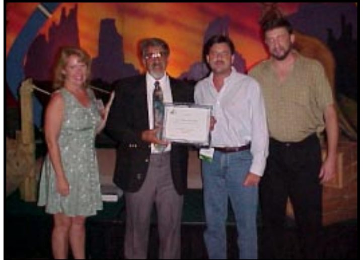
Outstanding Urban Program