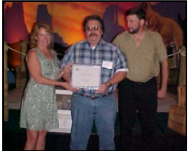
Outstanding Rural Program

* - if applicable; counties and municipalities are structured differently within the state.