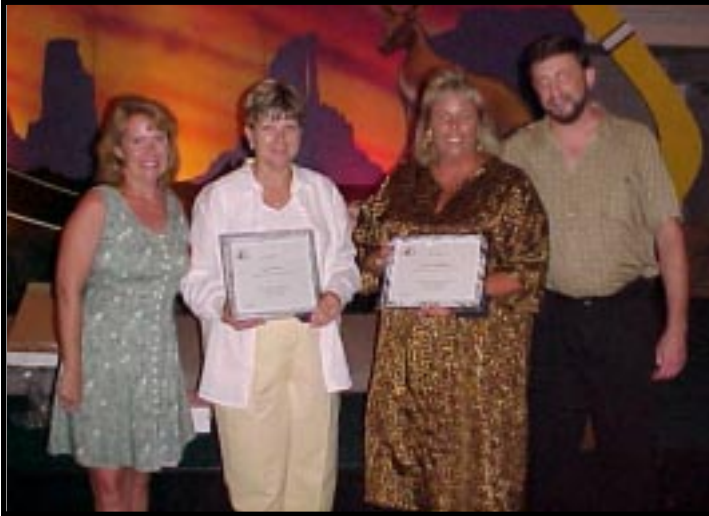
Outstanding Partnership Awards